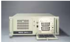
Figure 2.1: Front panel section

Refer Figure 2.1 to find system power LED and HDD LED on front bezel; power switch and system reset which are behind the door.