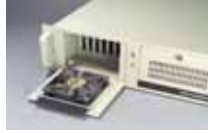
Figure 2-2: Cooling fan & filter

Refer Figure 2.2 to find location of system cooling fan and filter. Please replace system cooling fan if it is defective; replace or clearing filter when the dust is too heavy.