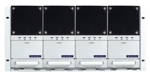
4 IPC-6025 combined as a 5U quad-system rackmount IPC