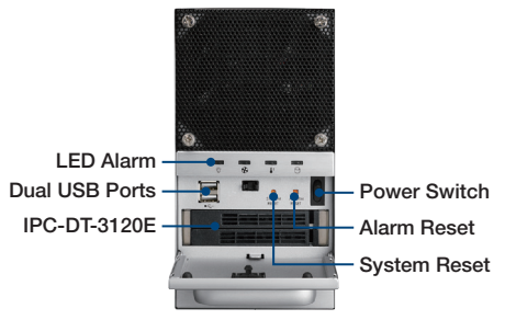
Note: Hot swap drive bay module should be bought separately.