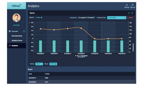
Store Traffic Analytics