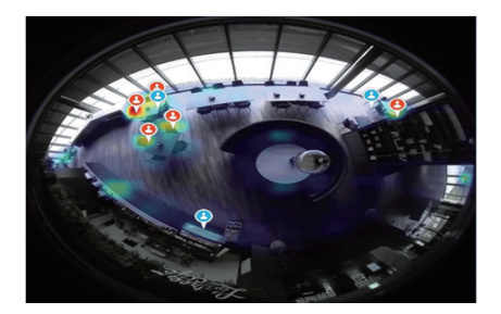
Store Heatmap Analysis