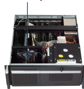
Easy-to-maintain system fan