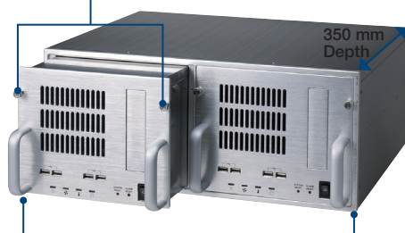
Dual Nodes Design

Thumb Screws to Fix The Sub-System in the Cage