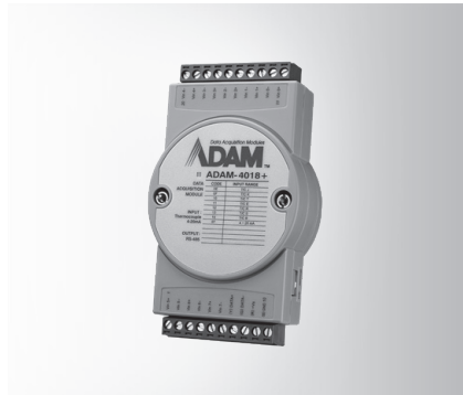
ADAM-4018+ CE FCC RoHS