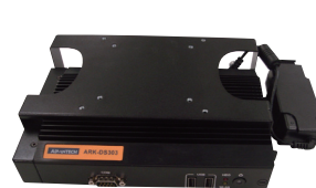
ARK-DS303 with standard mounting bracket