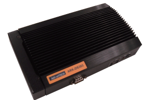
ARK-DS303 with WLAN module