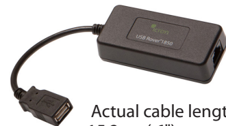
REX (Remote Extender)