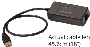
LEX (Local Extender)

The USB 1.1 Rover 1850 extends USB 1.1 connections beyond the desktop up to 85* meters.