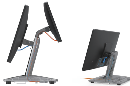
Single hinge stand + Dual display