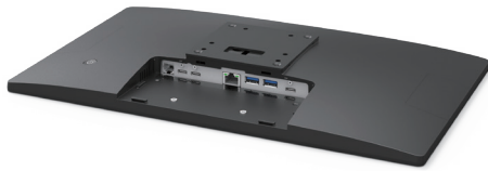
Integrate devices via USB-C