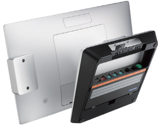
Connect hub to stand, supports separate operation